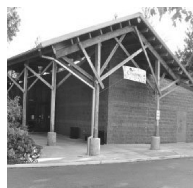
North Mason Timberland Library

Support Your Library! Join Your Friends' Group! Invite Your Friends To Be Our Friends, Too!